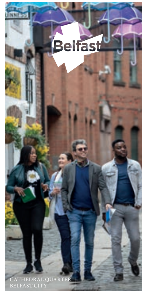
CATHEDRAL QUARTER BELFAST CITY