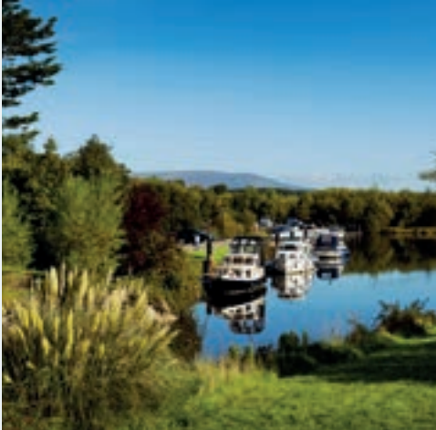
Canal Boats Leitrin village