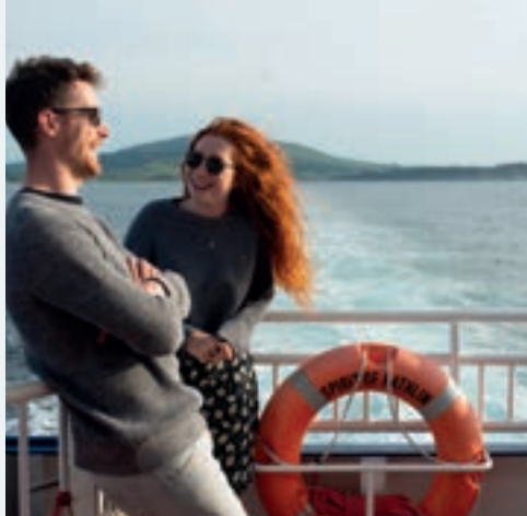
Rathlin Island ferry County Antrim