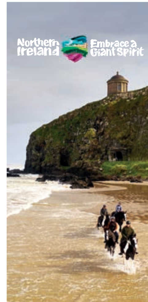
MUSSENDEN TEMPLE COUNTY ANTRIM