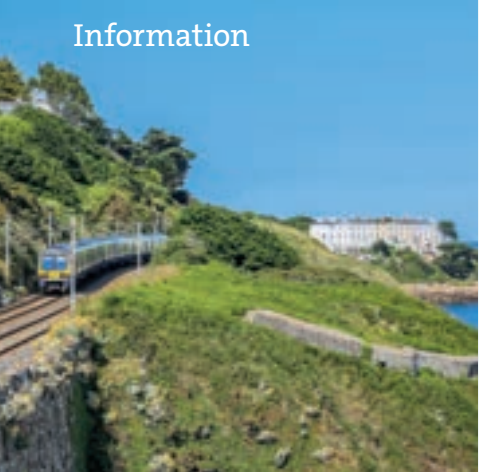
DART, Killiney County Dublin