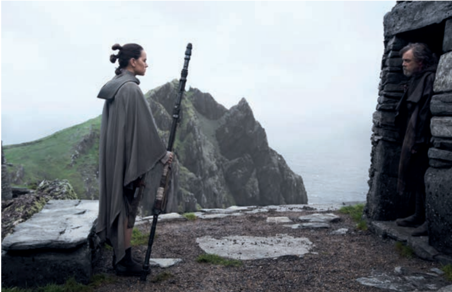
LUKE'S ISLAND WILD ATLANTIC WAY