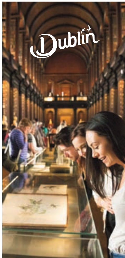
TRINITY COLLEGE DUBLIN