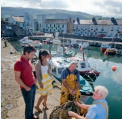
Carnlough Harbour County Antrim