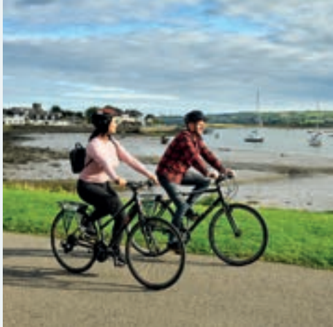
Waterford Greenway County Waterford