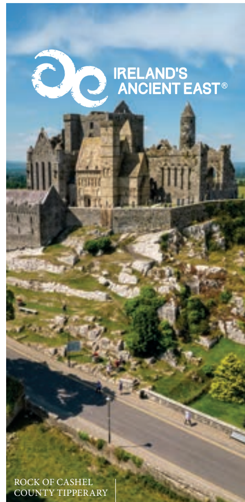
ROCK OF CASHEL COUNTY TIPPERARY