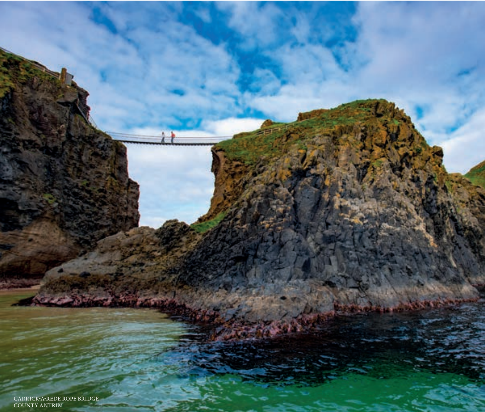
CARRICK-A-REDE ROPE BRIDGE COUNTY ANTRIM

Experience | Heritage | Food & Drink | Culture | Outdoors | On Location