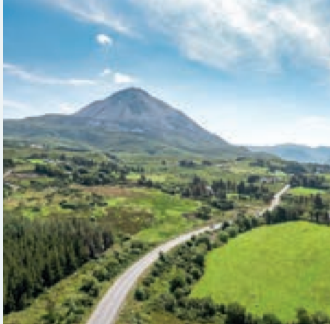
Mount Errigal County Donegal