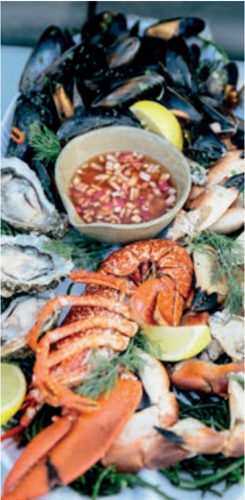
TASTE THE WILD ATLANTIC WAY