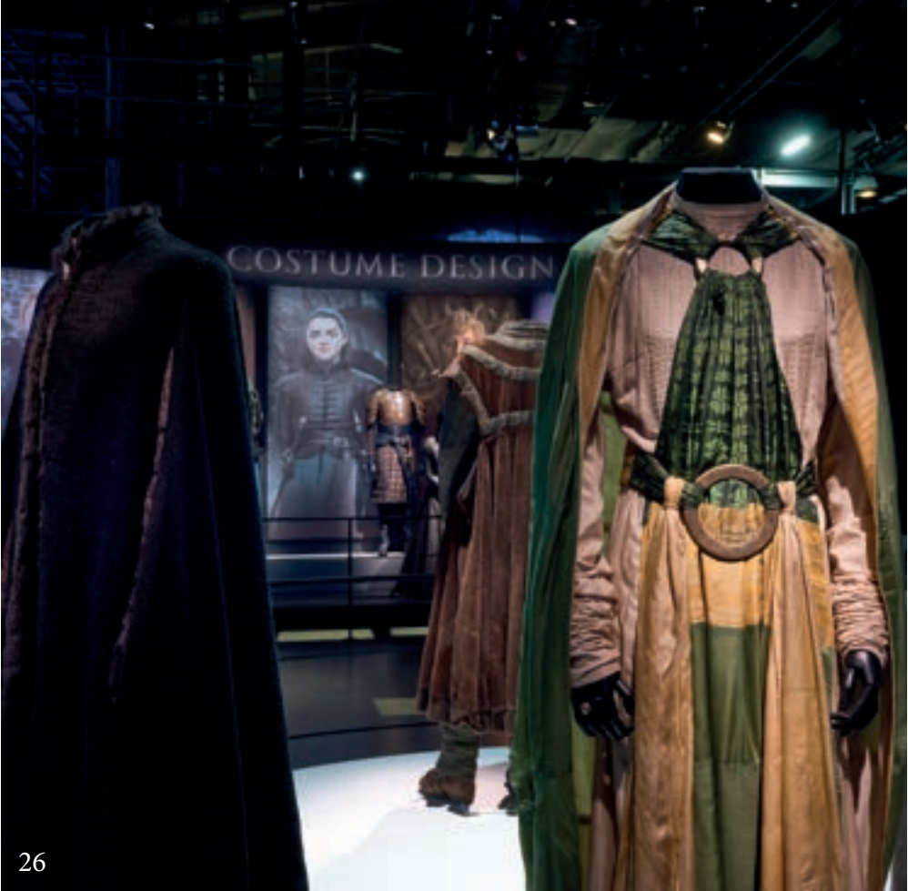
GAME OF THRONES STUDIO TOUR BANBRIDGE, COUNTY DOWN

“WITH A FUR CLOAK ON YOUR SHOULDERS, YOU CAN TEST YOUR AIM WITH ARCHERY OR HAVE A GO AT AXE-THROWING”