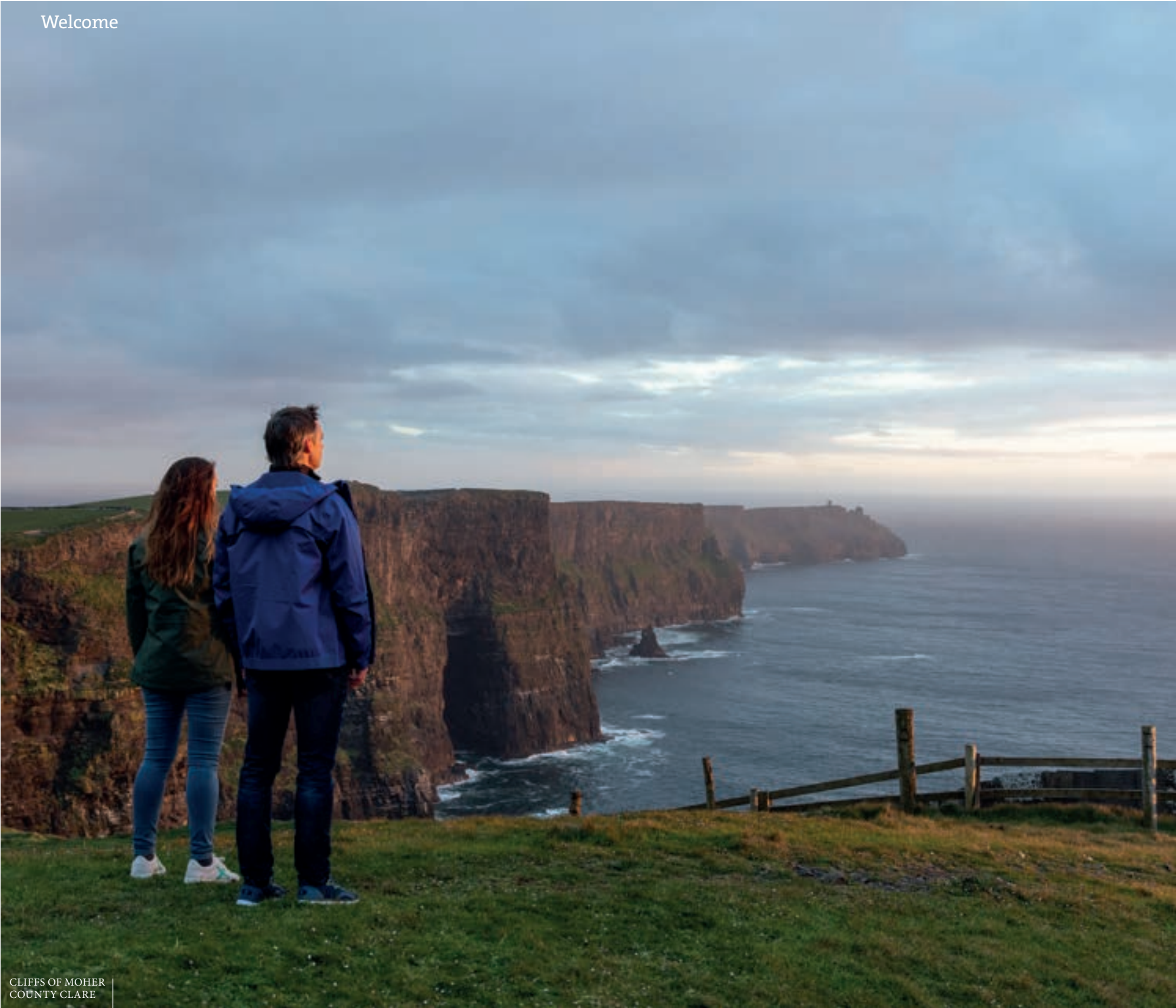
CLIFFS OF MOHER COUNTY CLARE