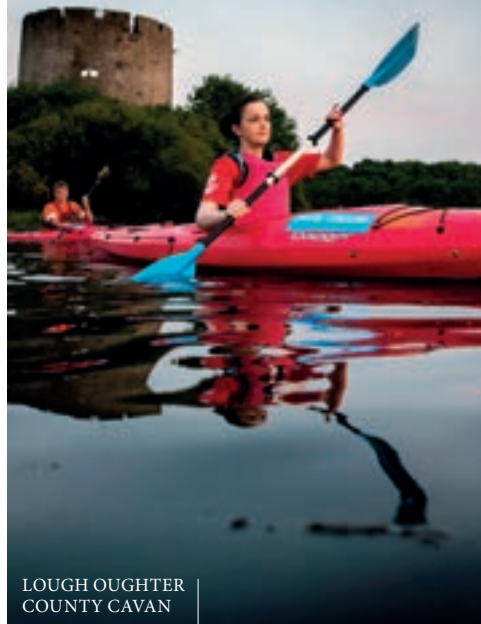
LOUGH OUGHTER COUNTY CAVAN