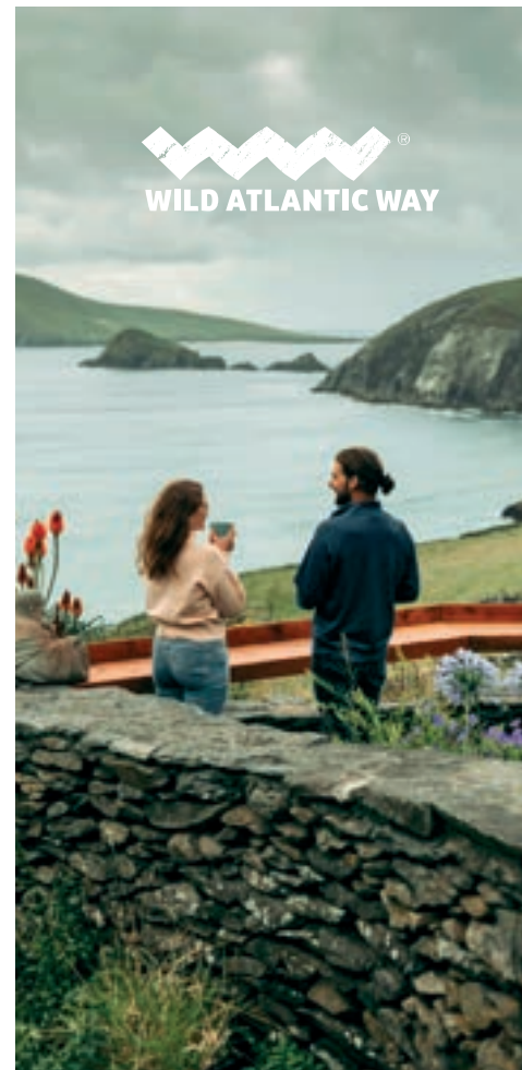
COUMEENOOLE BAY COUNTY KERRY