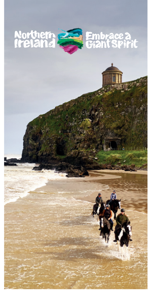
MUSSENDEN TEMPLE COUNTY ANTRIM

All in all, Belfast is a compelling place; a bit Victorian, a bit modern. Its story is enthralling, its people welcoming, and its contemporary culture utterly absorbing.